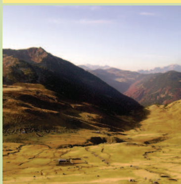
Peaks of the Balkans supported by: